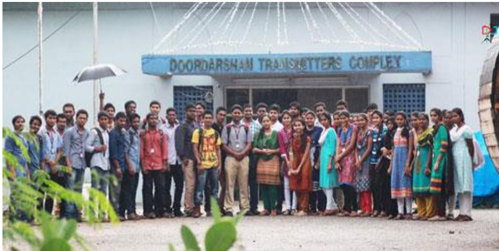
INDUSTRIAL VISIT To DOORDARSHAN COMPANY On 19-01-2017